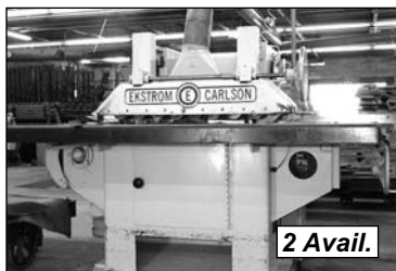
Ekstrom Carlson Straight Line Rip Saw