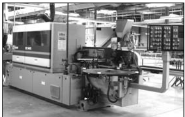
Homag SE9400 Edgebander