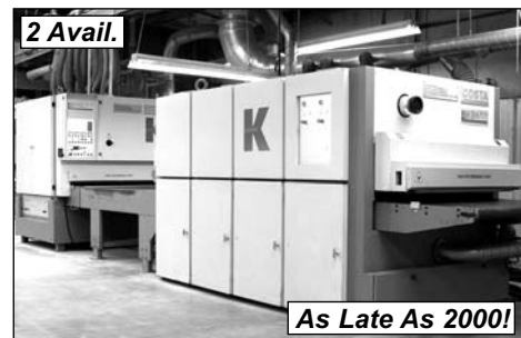
As Late As 2000!

Closing Online August 4 th , 5 th & 6 th