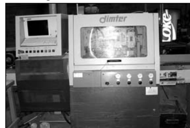
Dimter Optimizing Line