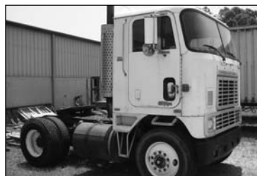
International Road Tractor