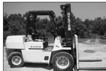
Hyster 90 XLZ Forklift w/ Side Shift