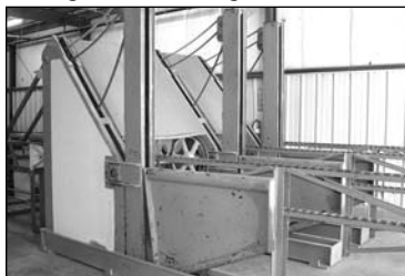
Tilt Hoist & Chain Deck