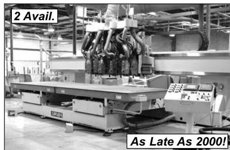
As Late As 2000!