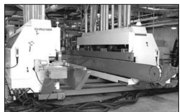
Celaschi Programmable Double End Tenoner