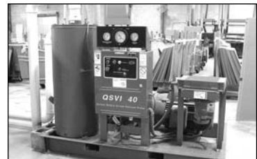
Quincy 3H Rotary Vacuum Pump