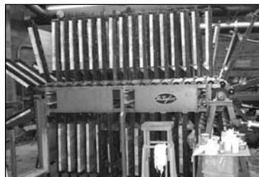
Taylor Clamp Carrier