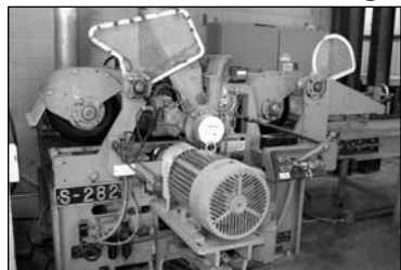
Newman S282 18" Surfacer