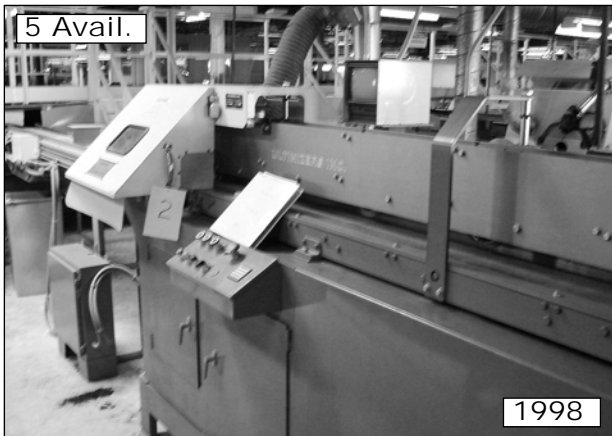
1998 Ultimizer Optimizing Lines

Assets no longer required for continuing operations of Bassett Furniture Industries ~ Bassett, Virginia