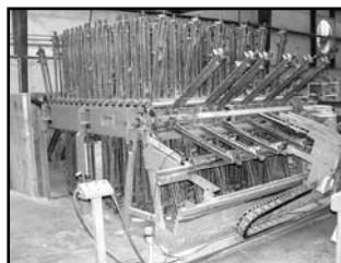
Taylor Auto. 8 1/2' 40 Section Clamp Carrier (Late)