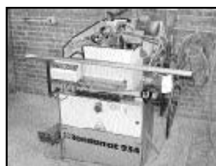
Weinig Rondamat 934 Profile Grinder