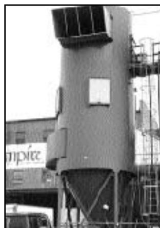
Torit / Carter Day 484RF Dust Collector (1998)