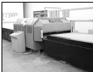
Shaw Almex T12-4x8 Thermo-Laminator/ Vacuum/Membrane Press (1996)