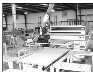
Heian NC-431P CNC Router w/ Fanuc Controller

CONNECTING BUYERS & SELLERS THROUGH TECHNOLOGY!