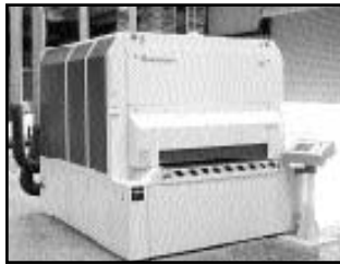
Heeseman MFA8 Multi-Purpose Wide Belt Sanding Machine (2002)

This is a partial list! Over 200 Lots Available! Tooling, Shaper Cutters, Lumber, Router Bits, Saw Blades, Cantilever Racking, Portable Tools, Dust Hoppers and much, much more!