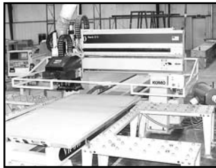
Komo VR 510 Mach II S CNC Router w/ Tool Changer, (2002)