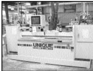
Unique 2700 CNC Maching Center Arch Door Shaper (2001)