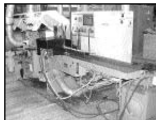
Weinig P22N Profimat 5-Head Moulder