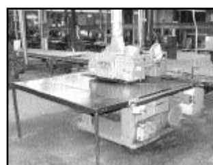
Mattison 404 Straight Line Rip Saw