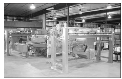
Tempering Line w/ Sanding & Glass Cleaning