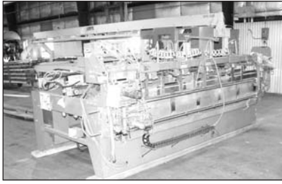
KVAL Commander Hinge Router & Borer (for doors)