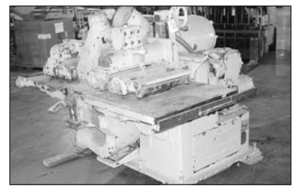
Tri-State 10 Special Roll Feed Gang Saw