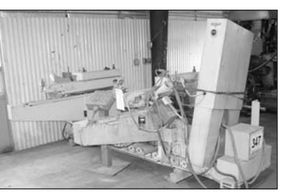
Mid-Oregon Double End Tenoner