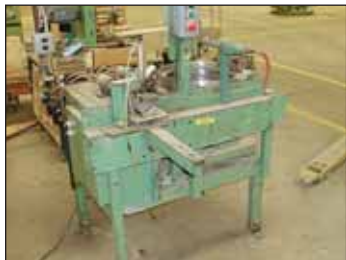
HBS Hanger Bolt Machine