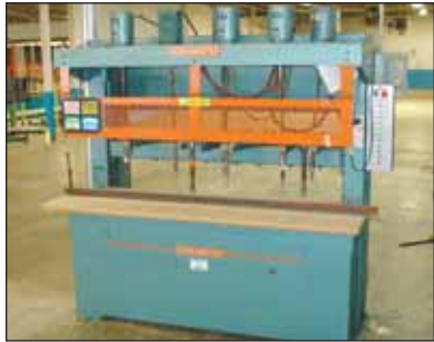
Cemco MVB Vertical Borer

Freightliner Diesel Tractor; 502123 Miles, Made by Cummings, Like New Wet System, s/n 3366917 International Truck 4900; 4 x 2, (1993) VIN # 1HTSDPNM9AH571683, 306,016 Miles, 218 Wheel Bass, Morgan Box Van 20, Lift Gate, Box GVFD912096 s/n on Bar MPA093VB08860001 (Plant #4)