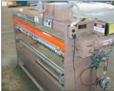
Vorwood 6215 Vinyl Slitter Rewinder