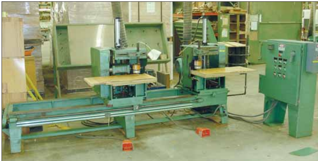
Chrisco Dbl. Sided Hyd. Hauncher