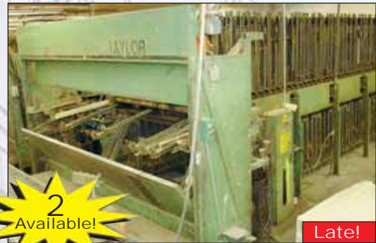
Taylor Auto. 80-Section Clamp Carrier