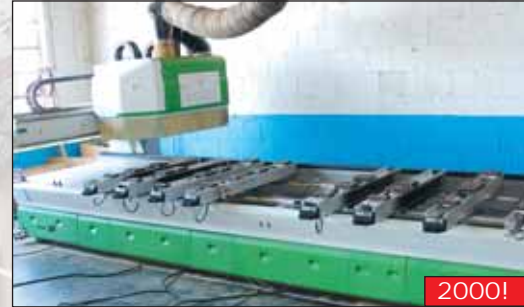
Biesse Rover 30-12 CNC Point To Point