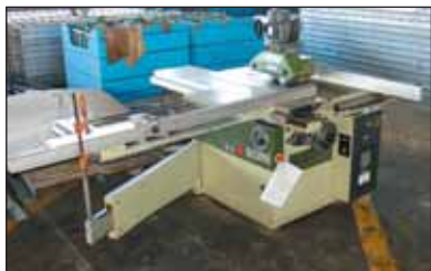
SCMI S116 Sliding Top Panel Saw