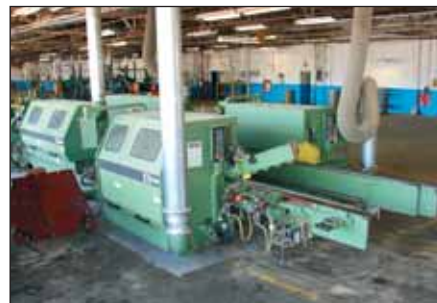
Homag KF 62/06/20/0A/2 Double Sided Combination Edgebander