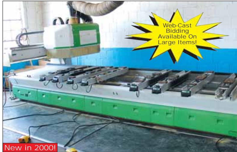
Heian ZR-442PF-R4-1616W CNC Router