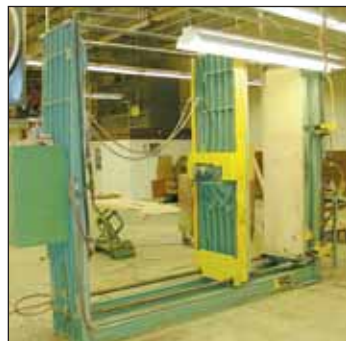
Lancaster 1105 Case Clamp