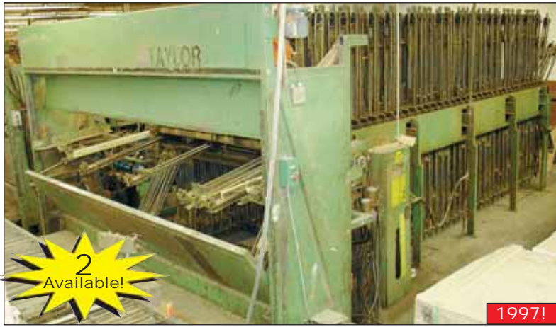
Taylor Auto. 80-Section Clamp Carrier