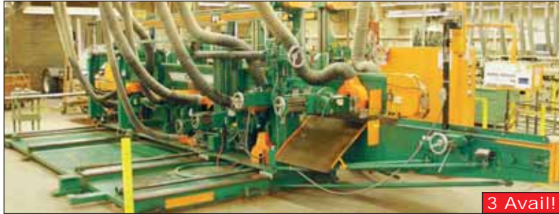
Fletcher Tolbert FM200-4 Tenoner w/Belt Sanding