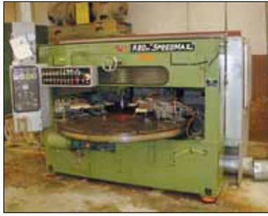
Rye R-80 SM Rotary Shaper