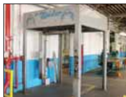
Spider Stretch Wrapper