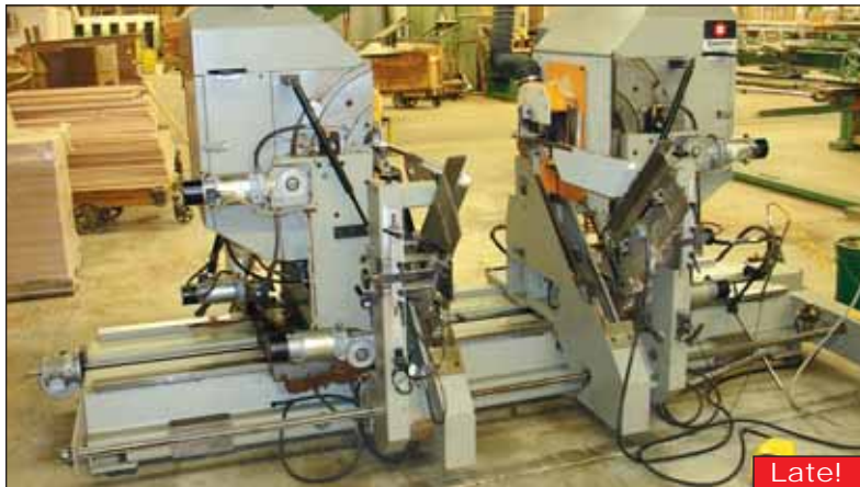
Balestrini Nova 3 CNC European Hopper Feed Dbl. End Tenoner