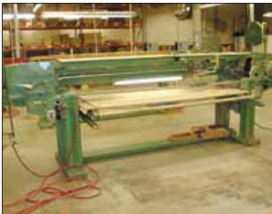
Oakley D-1 Stroke Sander

Greenlee 495 Table Saw W/Rack & Pinion Fence ; 40" x 43" Table, Approx. 5HP, 440V, 3-Roll Feeder & Universal Stand Tannewitz XJ Table Saw ; 7-1/2HP, 220/440V, 44-1/2" x 42" Table, 25" x 35" Auxiliary Table, Holz Her 3-Roll Feeder W/Universal Stand, s/n 84026