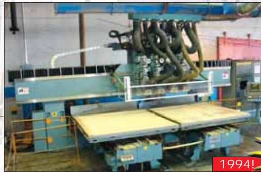
Heian ZR-442PF-R4-1616W CNC Router