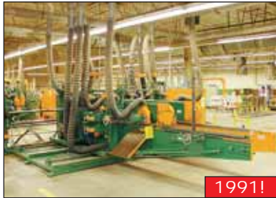
Fletcher FM-200D Dbl. End Tenoner (1991)