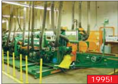
Fletcher FM200D Tenoner w/Belt Sanding