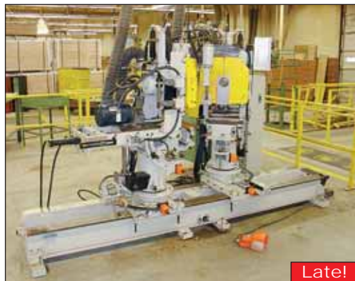
Norman Lambert Miller 424-R Hyd. Dbl. End Cut Off & Bore