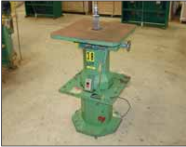
Jet Spindle Sander

Crouch Edge Sander ; Single Sided, 10" x 45" Platen, 9" x 48" Table & End Table, 7-1/2HP, 220/440V Oakley H-5 Oscillating Edge Sander ; Single Platen Size 58" x 9", 11-1/2" x 62" Tilting Table, End Table, Approx. 7-1/2HP, 440V, s/n 2133 (3) Oakley O Edge Sanders ; 48" Platen & End Table, 11" x 48" Table, 5HP, 208-220/40V B#18 B#17 Oakley R-9 Profile Edge Sander ; 3HP, 230/440V, Holz Her 3-Roll Feeder & Universal Stand, s/n 4881 Custom Made Profile Edge Sander ; 5HP, 230/440V, Holz Her 1112 4-Roll Feeder & Universal Stand Peerless Type Profile & Edge Sander