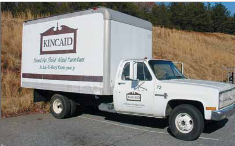
Chevrolet Custom Deluxe 10 Box Truck

Chevrolet Custom Deluxe 10 Box Truck ; (1983) 12', 80589 Miles Indicated, 5-Sp. Chevrolet Custom Deluxe 10 Pick Up Truck (1982) VIN 2GLDC14D3C1206398