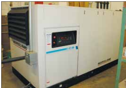
Ingersoll Rand SSR-EP125 Screw Compressor