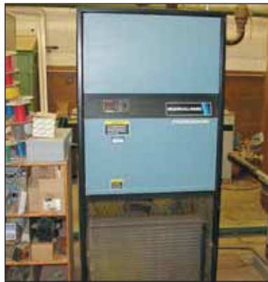
Ingersol Rand Dryer