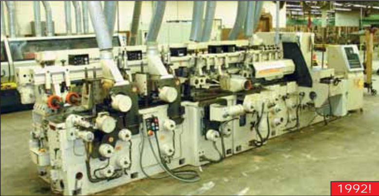
Iida M-222CII Woodsman CNC 8-Head Kogyo Moulder