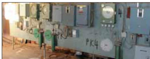
Controls To Dry Kilns