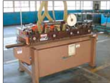
Voorwood L78 (Plough) Buff Type Foil Machine