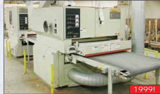
Timesavers 352-6 KABT Top & Btm. Planer/Sander