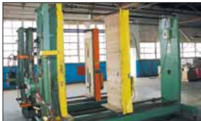
Lancaster Case Clamp