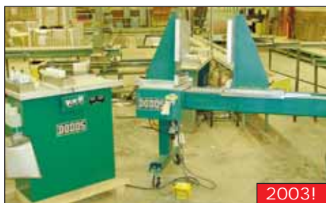
Dodds Dovetail Clamps & Gluers