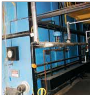
E Keeler Wood Fired Boiler