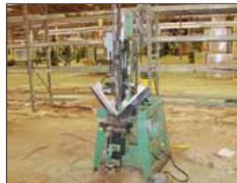
Cimmco Vee Nailer