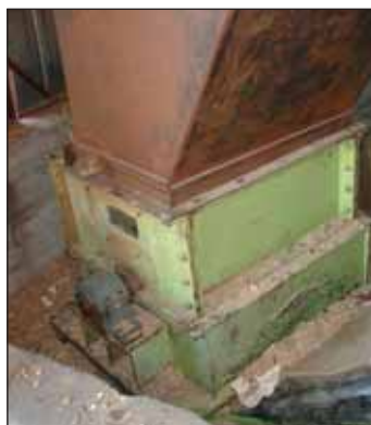
Lamb Hammer Hog