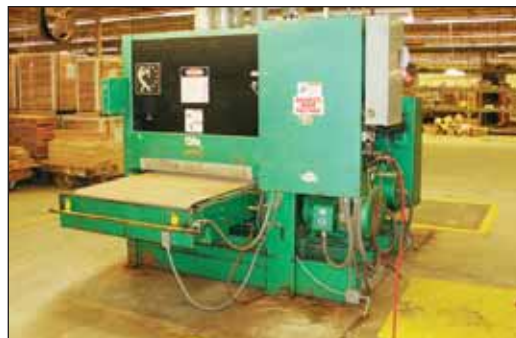
Timesaver 343-3 3-Head Wide Belt Sander