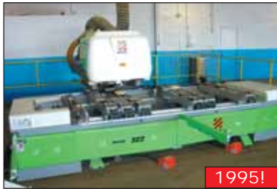
Biesse Rover 346 Pallet Changer CNC Point To Point, Machining Center