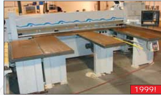
Holzma HPP11/38 CNC Front Loading Panel Saw