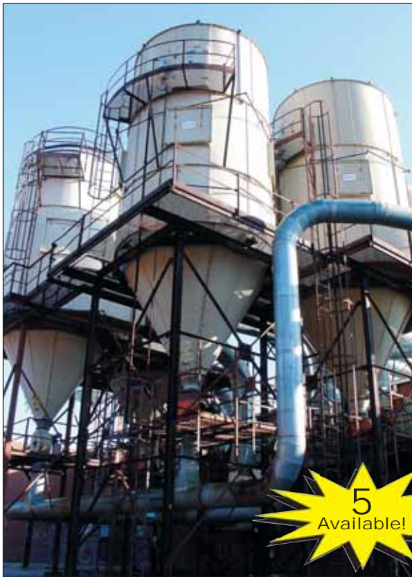
Pneumafil Dust Collectors