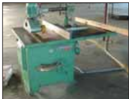
Tannewitz U Table Saw