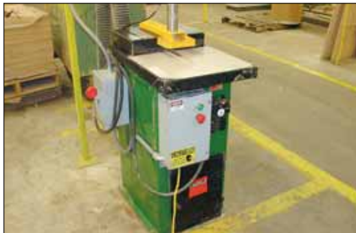
Castle Pocket Borer

Castle HD Pocket Borer W/Pneu. Treadle, 440V, Pneu. Holddown, s/n 51-348 (2) Down Draft Tables 36" x 60" HBS 62034 Hanger Bolt Machine; Rotary Hopper Drill Head & Inserter Unit B#41 HBS Hanger Bolt Driver; (2) Drills, 1-1/2HP, 1PH Motor Nichols Cleat Cut Off & Bore; (6) Angle Drills & Cut Off Saw, 1-1/2HP, 220/440V Cut Off Saw Motor, Hopper Feed, Approx. 1-1/2HP Boring Motor Grooving Attachment 2.5HP Redin Pinner; Pneu., s/n 26-71 Custom Lag Bolt Driver; 1HP, 1PH Sudreth Fletcher Vacuum Table; 36" x 60" Vacuum Table 37-1/2" x 60" (2) STS Sure Lack System Hot Melt Gluers Cure Lock 1211W Melt Gluer Baldor 1022 8" Grinder; 1HP, 115/230V Trinco Sand Blaster Rockwell 17-600; s/n 150 5750 Jet Arbor Press Simplex Time Clocks Throughout Plant #6 High Freq. Wood Welder & Guns