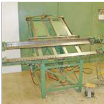
Lancaster 1861-B-225 Easel Clamp