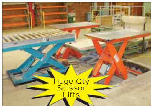
Misc. Scissor Lifts