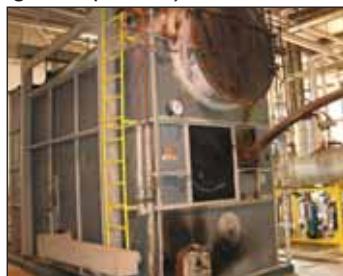
Abco Wood Dust Boiler