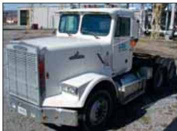
Freightliner Diesel Tractor