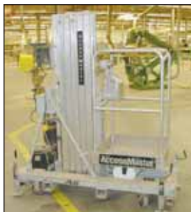
JLG Access Master AMS-24 Manlift