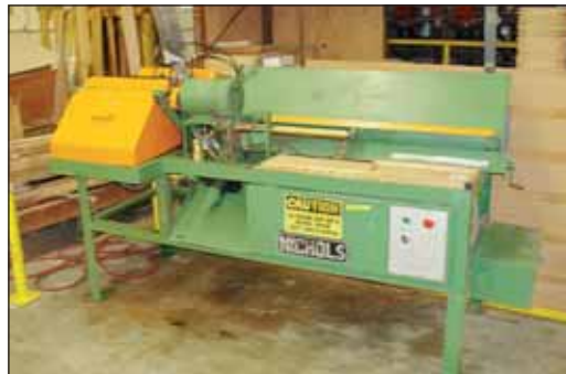
Nichols Cleat Cut Off & Bore