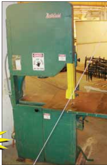
Northfield 36" Bandsaw