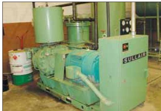
Sullair 32-200L Screw Type Air Compressor

Ingersoll Rand SSR-EP125 Screw Compressor; (1991) Approx. 200HP, 440V, Large Air Receiving Tank, s/n F2794U91 B#51