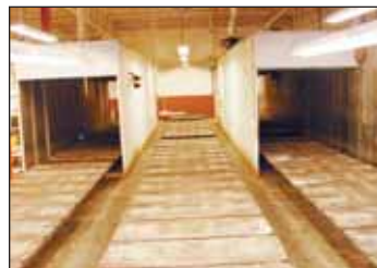
Production Systems Inc Complete In Ground Finishing Line W/Chain & Drives