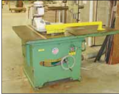
Tannewitz XJ Table Saw