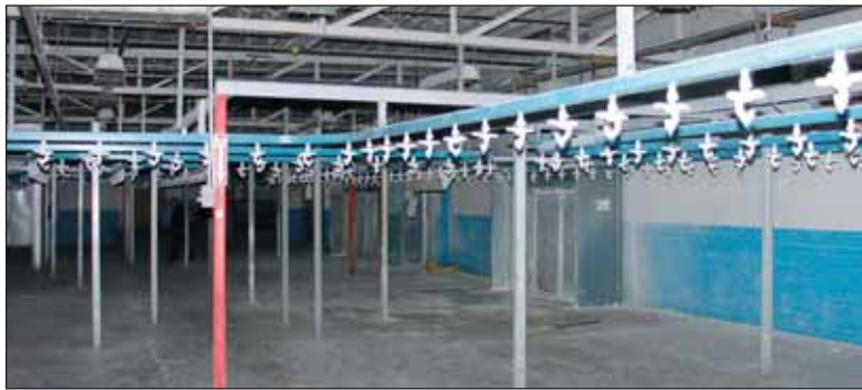
Jervis Webb Co. Unibilt Overhead Hook System (Plant #4)