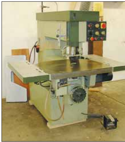
SCMI R-9 Auto Att. Overhead Router

Jeffrey 44WB Hammer Hog; Vertical Type, Approx. 34" x 27" Opening, Auto Feed From Bottom Approx. 36" x 8", 200HP, 440V, Clarage Fan Blower, Size 223, Type M, Series 1200, 75HP, 440V, s/n 11558 MDI Metal Detector System