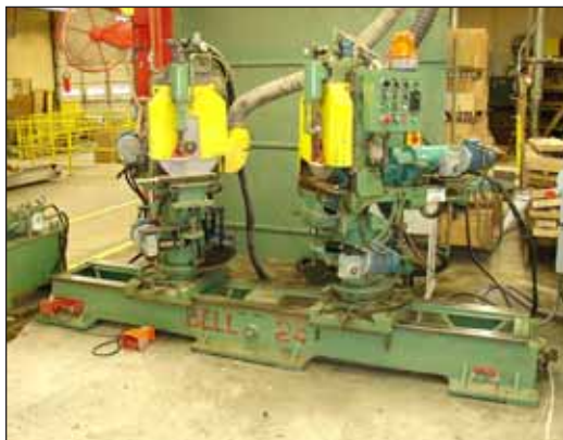
Bell 24 UPS Hyd. Conversion CNC Dbl. Cut Off & Bore