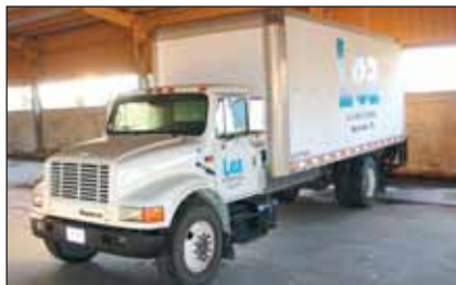
International Truck 4900