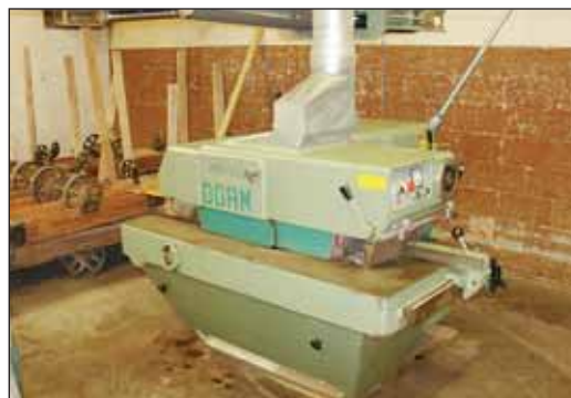
Ogam PO-280 Dip Chain Gang Rip Saw