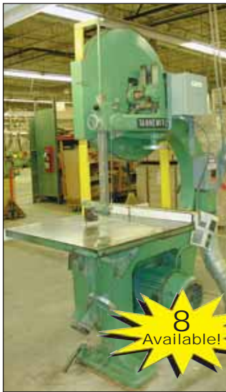
Tannewitz GH 36" Bandsaw