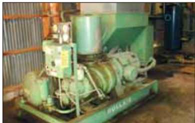
Sullair 25-150L Screw Compressor