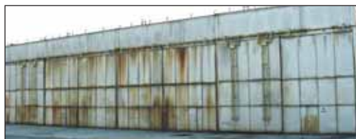
Irvington Moore Dry Kilns