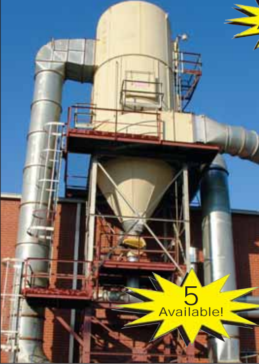
Pneumafil Dust Collectors