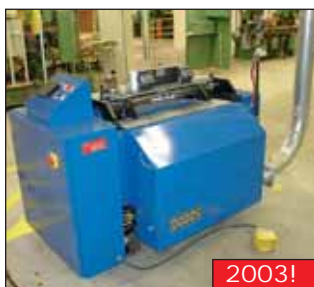
Dodds SE-25 CNC-TS-B Dovetailer