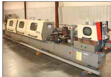
Futura Biesse Expert 820 Single Sided Edgebander w/ pre-milling