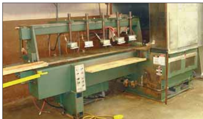
Onsrud WT2-1284H Lineal Hyd. 2-Spindle Profiler; 12" Cap.

Web Cast Bidding Available On Larger Items