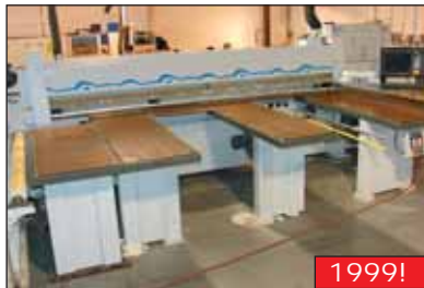
Holzma HPP11/38 CNC Front Loading Panel Saw & Feeding System