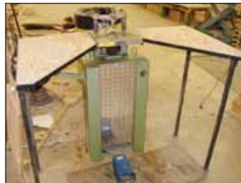
Brevetti AUT82 Miter Nailer