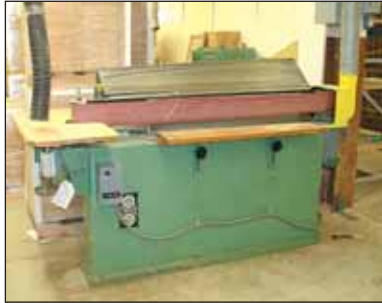
Crouch Edge Sander