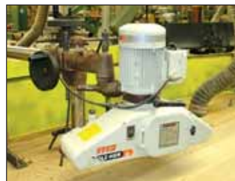
Holz Her Feeder