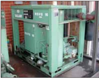
Sullair RSVS16-40 AC Vacuum Pump