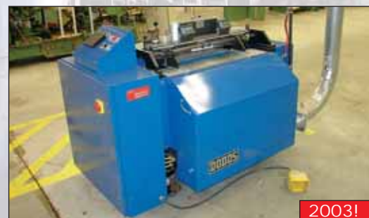
Dodds SE-25 CNC-TS-B Dovetailer