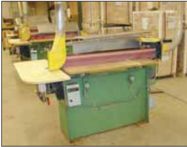
Oakley Edge Sander

Oakley D-1 2-Belt Stroke Sander ; 8' 6" Cap., 36" x 103" Table, Stroke Attach., 7-1/2HP & 5HP, 220/440V Motors, A & B Variable Speed Attach On Belt, s/n 4879 Oakley D Stroke Sander ; 8' 6" Cap., Stroke Attach., 7-1/2HP, 220/440V, 35" x 104" Table, s/n 4878 Heesemann DBV-1 Dbl. Belt Feed thru Stroke Sander ; 90" Cap., (2) Approx. 20HP, 440V Motors, 45kw, Control Panel, s/n 7612091