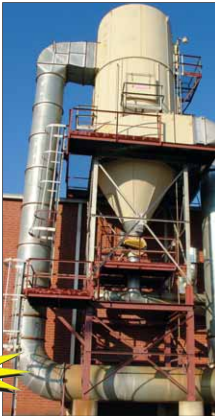
Pneumafil Dust Collectors