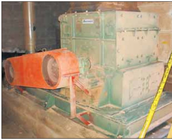
Jeffrey 44WB Hammer Hog