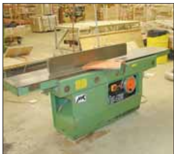
Casadei DS410 16" Jointer