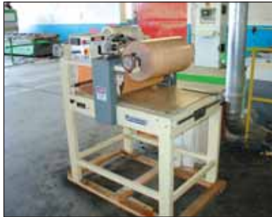
Vorwood L85 Vinyl Or Foil Laminator