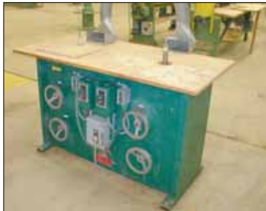
Fletcher Tolbert FT-40 Double Spindle Sander