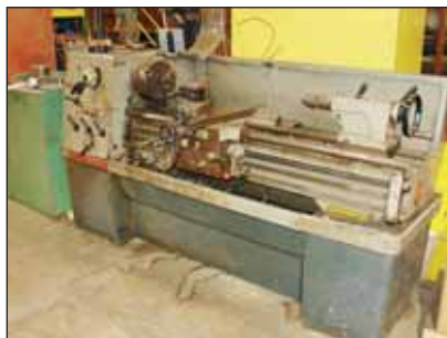
Clausing Colchester 15 Metal Lathe

JLG Access Master AMS-24 Manlift; Max. Cap. 350 Lbs., Platform Height 24', 12V V.D.C., 1PH, s/n 7028