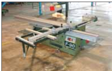
Altendorf F90 Sliding Top Panel Saw

SCMI S116 Sliding Top Panel Saw w/Scoring; Approx. 7 1/2HP, 440V Motor, 14" x 60" Sliding Top W/Fence Attachment & Stop, Main Table 25" x 45", Fence, Includes Nandina 3-Roll Feeder & Stand