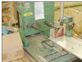
Hnager Bolt Driver