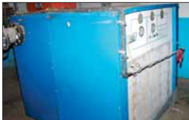
Van Air RA-2000 Compressed Air Dryer