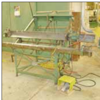
Handy Easel Type Clamp

Lancaster 1200-B-165 Pneumatic End Clamp; (2) Opposing Jaws 36" x 30" High, 42" Opening