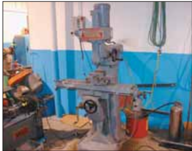
Millrite MVN Powermatic Milling Machine