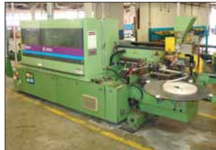
Homag KLO 74/DA/20 Single Sided Edgebander (1994)

Vorwood L85 Vinyl Or Foil Laminator; 21" Wide, Flat Belt Feed Thru 21" Wide, Roller Temperature Heat, 1/2 HP, 208/220/440V *See photo on pg 5