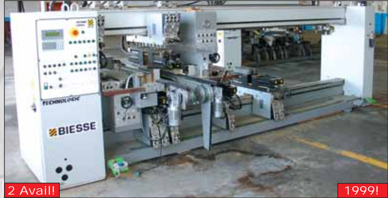
Biesse Technologic Double End Feed Thru Vert. & Horiz. Multi Spindle Borer