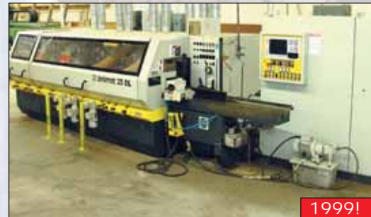
Weinig U23EL/025 CNC Feed Thru Moulder