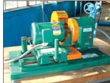
Fletcher FM-80 G Roll Grinder