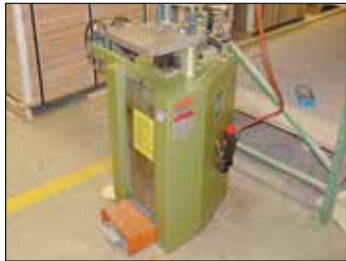
Brevetti AUT82 Miter Nailer