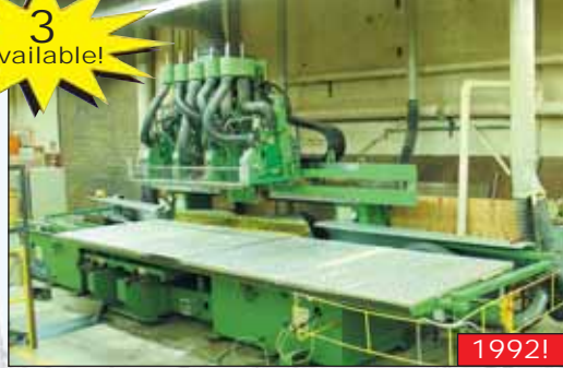
Shoda NC-516P 1626 CNC Router