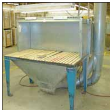
Down Draft Table