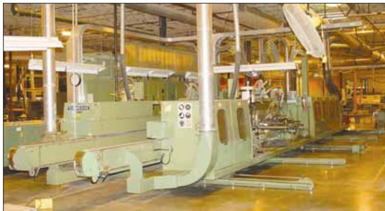
Torwegge H732G26 Combination Machine/Double End Tenoner/ Edgebander

Marbel Laminate (5) Gang Slitter MLS-12, S# 50026, 1997, 12" cap., 1/2hp, 1 phase, 110v.