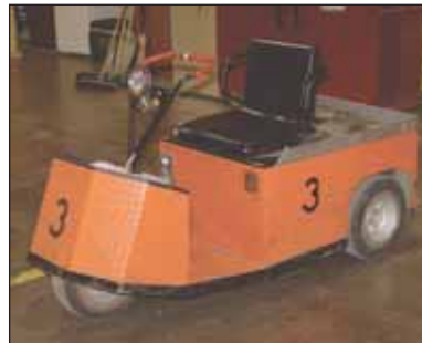
Taylor Dunn Electric Maintenance & Transportation Vehicles, Large Qty.