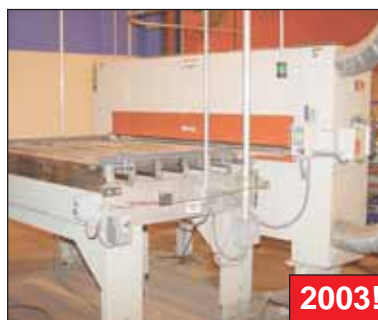
Black Bros. T & B Panel Cleaner