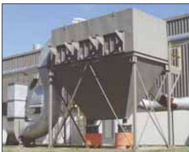
Farr 1HC TENKAY Industrial Air Prod.