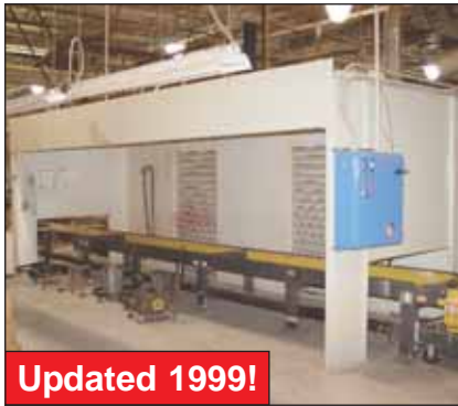
Flat Palletized Finishing Line