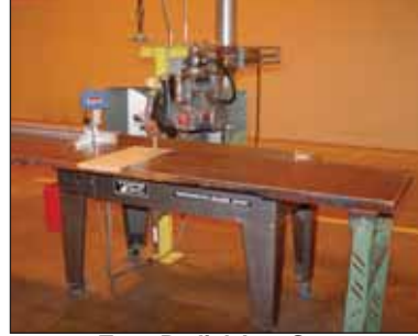
Tops Radial Arm Saw