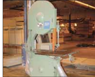
Tannewitz GH 36" Bandsaw