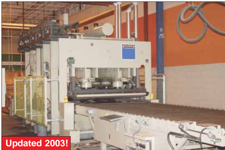
Wemhoner KT V 1E 810/2 Press Line (Rear View)