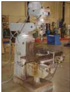
Lagun Vert. Mill