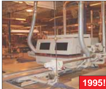
Wisconsin Auotmated Machinery (Challoner) Vector 4 Double End Tenoner