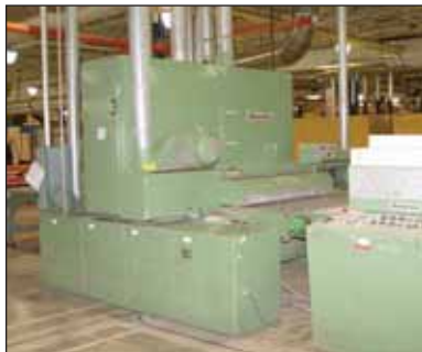
Heesemann KSA-4 Wide Belt Sander