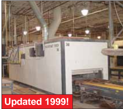
Flat Palletized Finishing Line