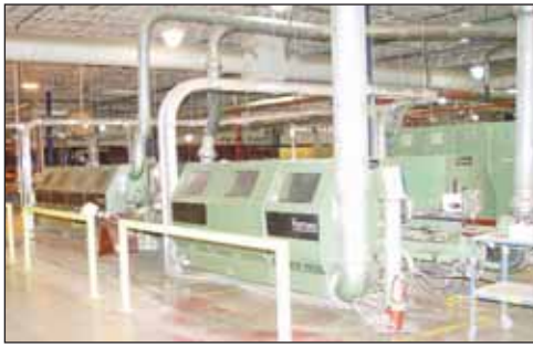
Homag Tenoner/Edgebander KF65/13/C/25/2500