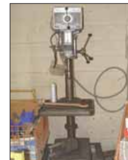
Rockwell Drill Press