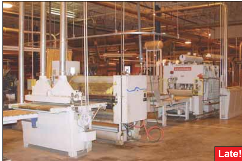
Wemhoner Press Line Overview

Wemhoner Line (1985) 1st Station: Walter Tilleke RM1300 Top & Bottom Panel Cleaner, s/n 993, 51" wide capacity, (2) approx. 1½HP top adjusting (asset # 423434) 2nd Station: Fritz LWE2-14 Top & Bottom Glue Spreader (1999) 56" wide capacity, (2) 6" dia. chrome doctor rolls, (2) 8" rubber application rolls, pneumatic pressure on rolls, top adjustable manual digital Homag Group DLC Controls, digital readout on opening, 3" max. height adjustment, (2) .55kw roll drives, 480v, 16 amp 3rd Station: Knife/Drip Table w/ Infeed Belt Conveyor; 36" x 76" knife table, .12kw drive motor. Infeed Belt Conveyor: 40 x 92, approx. ½HP. 4th Station: Wemhoner Hot Press (1985), Pump# 503, Betriebsdruck 275 ATV, Max. PSI 210 Ton, Antriebsleistg 60kw, 460v, platen size 39½" w x 78¼", (3) down pressure cylinder - 7" dia., oil heated platens, approx. 10HP circulating pump motor, Mylar belt feed (top & bottom), 2.2kw varidrive feed motor, Omega temperature digital readouts, free-standing control counsel, short stop brake, HTT Electric Boiler (1985) Type: WTE ) 08-5-60-1, FAB# 8.2806, Leistung 60kw , Betriebsunderdruck 10 Bar, Betriebstemp 300°C, Inhalt 15 liter, Mind. Vol-STR 10 m3/H, Vaumuster 64kw, 3PH, Honeywell Temperature controller, m/n UDC3000 5th Station: Outfeed skate wheel conveyor 38½" x 82", Wemhoner s/n 1301-0785