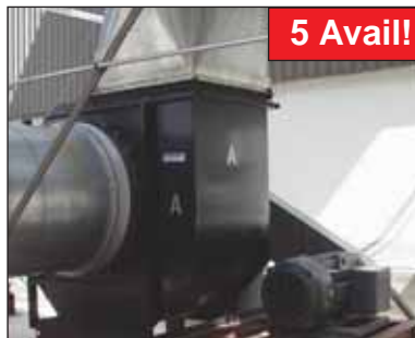
Sample Photo of Pneumafil Blowers