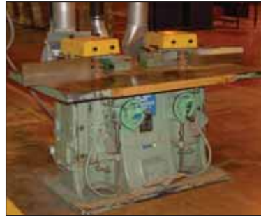
Whitney 91 Dbl. Spindle Shaper