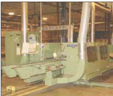
Torwegge H634 Double End Tenoner