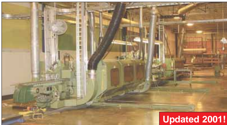
Torwegge Double End Tenoner/Softformer

Torwegge H732G26 Combination Machine/Double End Tenoner/ Edgebander (1986); total power 180kw, 300 amps, 10' width capacity, 6' load space, Euro-Style overhead belt holddown w/ pneumatic. 1st Post: jump score bottom, 3HP mounted on tilting cut off saws, 6kw, left & right side. 2nd Post Back: tilting jump cope, 2-speed, 6.1/8.6HP. PVA glue pot pumping station, left & right, heating zone - infrared lights station left & right, coil & strip feed station left & right, pneumatic pressure roll station left & right, blower & heated air station left & right, end trim station, 1HP left & right, top & bottom trim 2HP, 3kw left & right, top & bottom fine trim tilting 2HP left & right, jump milling head 5HP station left & right, jump milling head 5HP station left & right, jump milling head 5HP station left & right, (2) 3-point belt sanding station 36" between rollers - form block 1.2kw left & right, (2) 2.5kw powered bridge raise & lower, (2) 11kw vari-drive feed motors, (2) frequency converters, free standing electrical panel, s/n 070