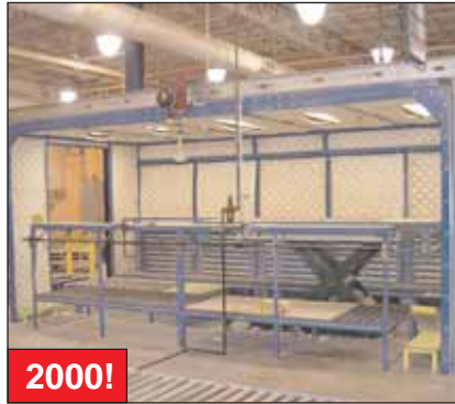
(2) Torit Feed Through Sanding Booths