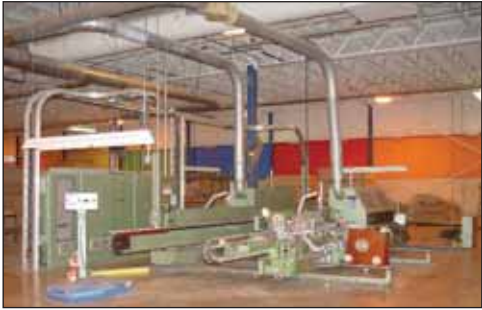
Homag KL-69/C/35/2 Double Side Edge Banders