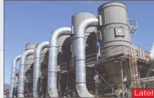
View of Pneumafil Dust Collectors

Auctioneer's Note: This 1,000,000 square foot facility is packed with late model panel processing equipment! This is a must-attend, three-day sale! Mark your calendar now!