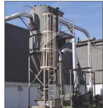
Griffin/Lamson High Velocity, Low Volume Dust Collector