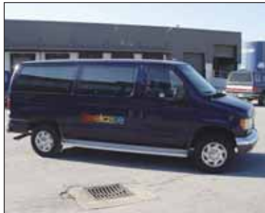
Ford Club Wagon XLT Van