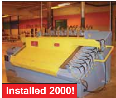
L & L Hi Freq. Gluer Machine