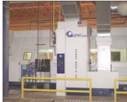
Garmat Sanding/Spray Booth