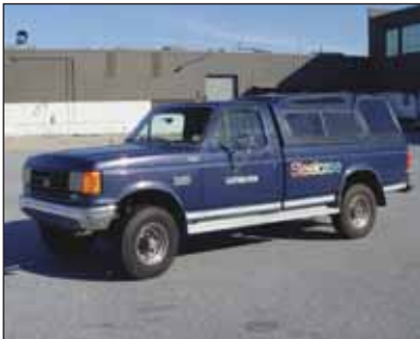
Ford F250 Pickup Truck