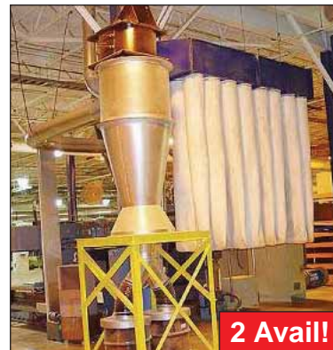
(2) Nordfab Dust Collectors