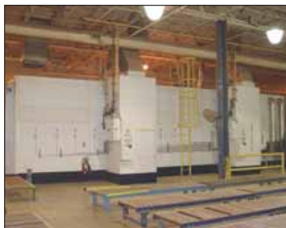
Garmat Bake Oven