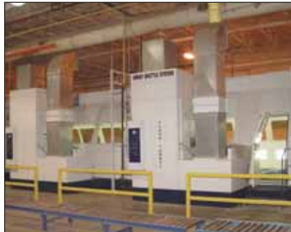
Garmat Spray Booth/ Flash Off Tunnel