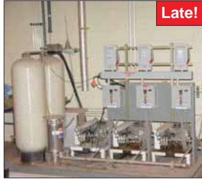
American Moistening/Humidification Sys.