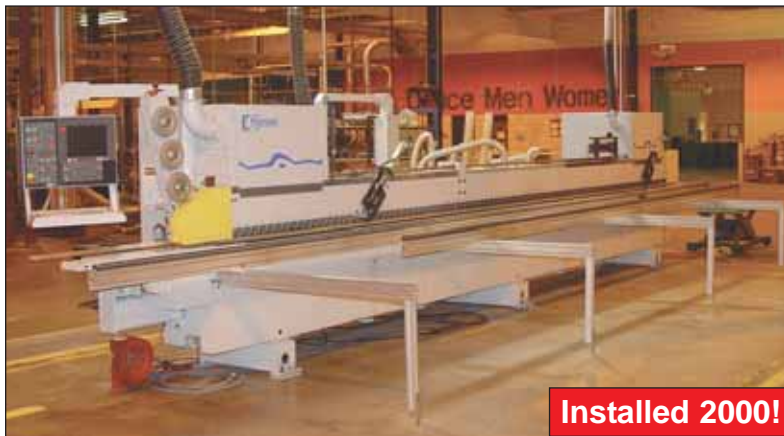
Homag Profiline VFL 78 Linear Post Former