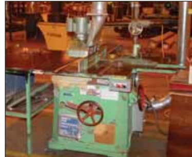
Northfield #4 Table Saw