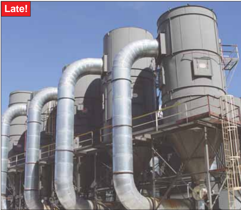
View of Pneumafil (4) 13.5 & (1) 11.5 Dust Collectors