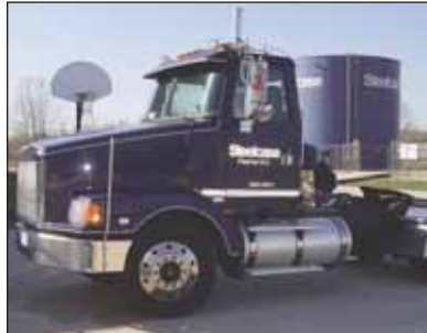
Volvo Switcher Tractor

Ford L8000 Switcher Tractor, (1999); Vin# 1FDYR82E7RVA52396, 117,342 miles, auto fifth wheel uncoupler, raise and lower fifth wheel, Ford turbo diesel engine, location outside, m/n C8.3-250 Volvo Switcher Tractor, (1990); VIN# 4V1VBBE9MN638276 243,544 eaton fuller road ranger trans, 9 speeds forward, sliding 5th wheel, Caterpillar 3306B turbo diesel engine 3306B, location: outside Ford Club Wagon XLT Passenger Van, (1995) VIN#1FBHE31H8SHA93532, 107,935 miles indicated, location outside Ford Club Wagon XLT Passenger Van, (1984) VIN#1FBHE21G1EHC12737, 129,160 miles indicated, 4 row seating, location outside Ford F250 Custom Long Bed Pickup Truck, (1988) 140,423 miles indicated, location outside, VIN#2FTEF26H9JCA45817, Automatic 4WD, 4 row seating, 5.8 liter V8, 4 row seating, air conditioning, fiberglass cap Taylor Dunn Maintenance & Transportation Vehicles - Large Quantity!