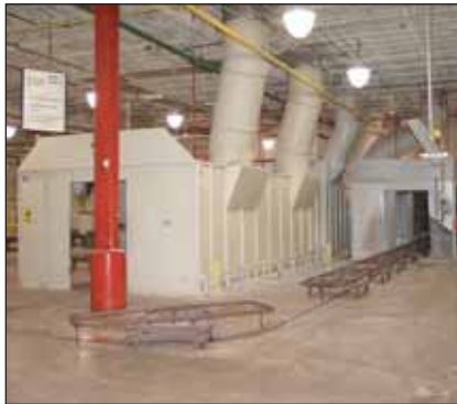
SI Case Good Finishing Tow Line