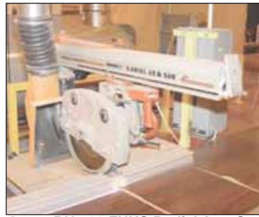
Omega RN 700 FNUS Radial Arm Saw

Powermatic 1150 A Drill Press , 15", 3/4HP, 230/460v, s# 8415V130