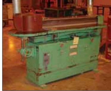
Whirlwind 855 Edge Sander