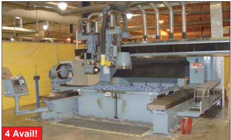
(4) Heian NC-251MC, 4 Axis CNC Routers w/ATC,