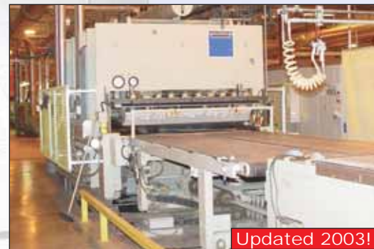
Wemhoner KT V 1E 810/2 Line