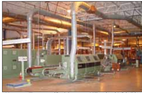
Homag Tenoner/Sofformer KF66/12/GS/25/11