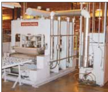
Wemhoner Press Rear View