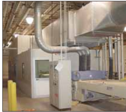
Giardina Flat Line / Robotic Spray / Drying Vert. Stack Oven