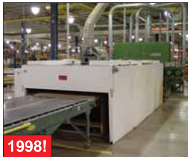
Reverse Roll Coat/ Heat Drying Tunnel/Sanding Line