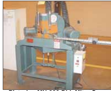
Pistorius MN-200 Dbl. Miter Saw