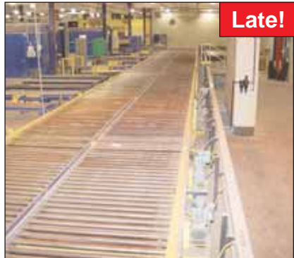
Hytrol Material Handling Case Roll Conveyor System