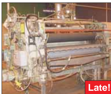
Black Bros. T & B Glue Spreader