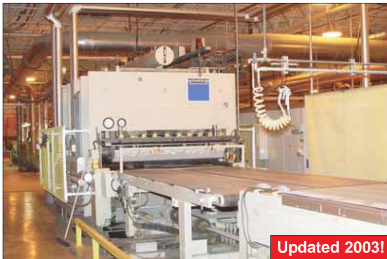
Wemhoner KT V 1E 810/2 Press Line (Front View)