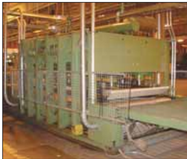
Wemhoner Rear View

Wemhoner Line (1985) 1st Station: Walter Tilleke RM1300 Top & Bottom Panel Cleaner, s/n 993, 51" wide capacity, (2) approx. 1½HP top adjusting (asset # 423434) 2nd Station: Fritz LWE2-14 Top & Bottom Glue Spreader (1999) 56" wide capacity, (2) 6" dia. chrome doctor rolls, (2) 8" rubber application rolls, pneumatic pressure on rolls, top adjustable manual digital Homag Group DLC Controls, digital readout on opening, 3" max. height adjustment, (2) .55kw roll drives, 480v, 16 amp 3rd Station: Knife/Drip Table w/ Infeed Belt Conveyor; 36" x 76" knife table, .12kw drive motor. Infeed Belt Conveyor: 40 x 92, approx. ½HP. 4th Station: Wemhoner Hot Press (1985), Pump# 503, Betriebsdruck 275 ATV, Max. PSI 210 Ton, Antriebsleistg 60kw, 460v, platen size 39½" w x 78¼", (3) down pressure cylinder - 7" dia., oil heated platens, approx. 10HP circulating pump motor, Mylar belt feed (top & bottom), 2.2kw varidrive feed motor, Omega temperature digital readouts, free-standing control counsel, short stop brake, HTT Electric Boiler (1985) Type: WTE ) 08-5-60-1, FAB# 8.2806, Leistung 60kw , Betriebsunderdruck 10 Bar, Betriebstemp 300°C, Inhalt 15 liter, Mind. Vol-STR 10 m3/H, Vaumuster 64kw, 3PH, Honeywell Temperature controller, m/n UDC3000 5th Station: Outfeed skate wheel conveyor 38½" x 82", Wemhoner s/n 1301-0785