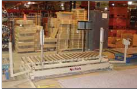
Nichols Case Flipper

Homag Double Sided Combo. Machine w/ Edgebanding & Sizing KF65/13/C/25/2500, Price New $415,855 480 Volt, 310 Amp, 102" Width, Approx. Cap., 2 3/4 Rubberized Track, Pop up Dogs Every 19 9/16", Load Space 52", First Station- Tilting Cope 11/HP, Second Station-Score, (Tilting) 1.3 HP, Score/Trim, Third Station-Tilting Cope Head 11/HP, Fourth Station-Pre Milling Head Tilting 4/6 HP, Fifth Station-2nd Pre Milling Tilting Head 4/6 HP, Sixth Station-Profiler-Milling Tilting Head 4/6 HP, Seventh Station-Gluing Station-Hot Melt, Eighth Station-Pre Heat Hot Air/Heat Lamps, Ninth Station-Banding Application Strip or Coil (Separate Stations), Tenth Station-Hot Air, Eleventh Station-Pressure Application, Twelfth Station-End Cut Off, Thirteenth Station-Top & Bottom Trim/Profile, Fourteenth Station-Aux/Profile Head Tilting, Fifteenth Station-Aux/Profile Head Tilting Top & Bottom, Sixteenth Station-End Profile/Rounding, Seventeenth Station-Belt Sanding, Eighteenth Station-Top/Bottom Buffer, Electrical Control Panel, 1982 Machine, s/n 0-065-16-0027