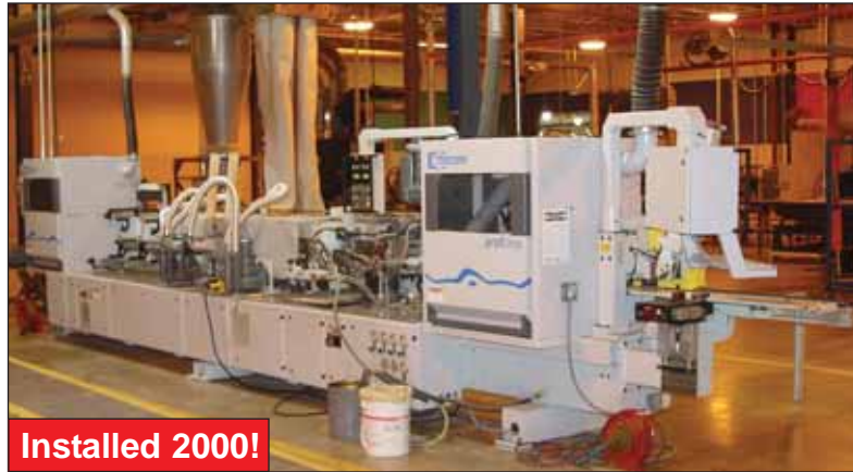
Homag Profiline VFL 78 Linear Post Former

Homag Profiline, VFL 78 Linear Post Former (1999) installed 2000, Price New $254,515, 480v, 80/100 amp, Homatic NC 21 Controller w/keypad 12" color monitor, 170 MB memory processor, 32 bit 16 MB Ram. OS9 operating system ethernet connections, vari speed from 8 to 30 m/min, work piece over hang 70mm, work piece w/150mm, work piece length 700mm, laminate over hang 50/150mm, profile depth top 40mm, profile depth bottom 40 mm, door length up height 40mm, door length up width 40mm, laminate thickness .09mm. Stations: (1) tilting milling head 30 degrees 0 degrees 90 degrees. (2) tilting milling head 30 degrees 0 degrees 90 degrees, manual digital adj. thru machining. (3) glue injection (4) water applications (5) laminate trim (6) 5 pva nozzle application (7) heating & ventilation station. (8) top & bottom post formate pressure application (9) tilting 0 degrees to 50 degrees trim station 1.4kw, short stock feeding station attachment, 5.5kw vari drive track motor, 3"W rubber patted feed chain, 5' out rigger double row, 1.8kw raise & lower, double vee belt, hold down w/pneumatic over head, application cyl., s/n 0 206 08 375