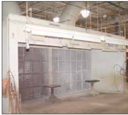
Spray Booth Example