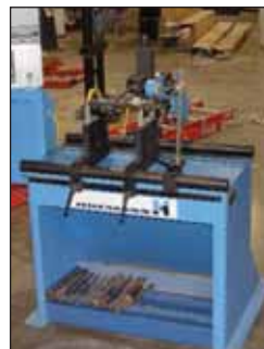
Hoffman Balance Stand