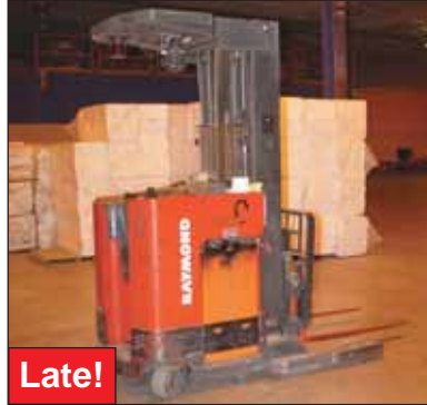
Raymond Stand & Ride Forklifts