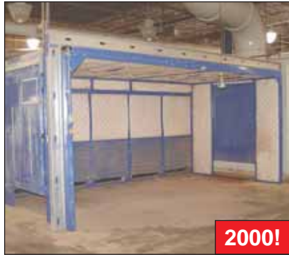
Torit/Donaldson Sanding Booth