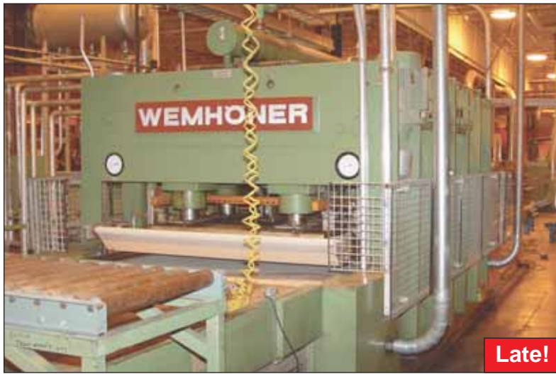
Wemhoner VOF 3-600/2 Type R25 Line