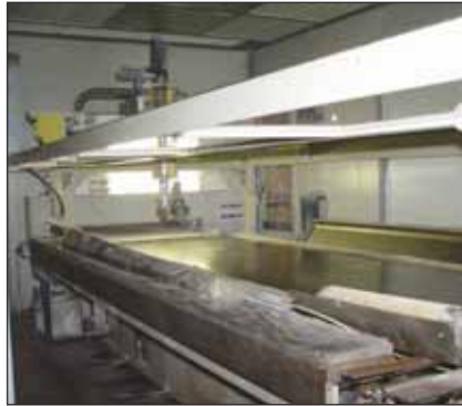
Giardina Robotic Spray Booth