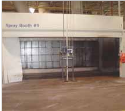
SI Case Good Finishing Tow Line