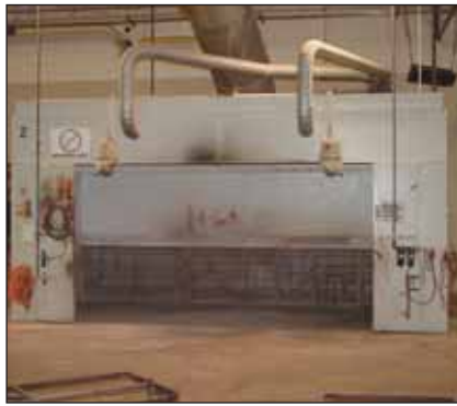
Spray Booth #2