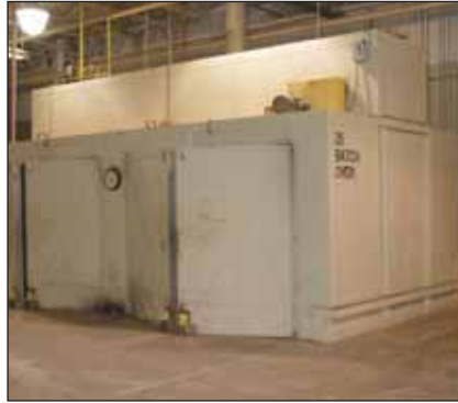
Batch oven #26