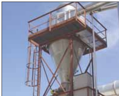
Trailer Loading Cyclone