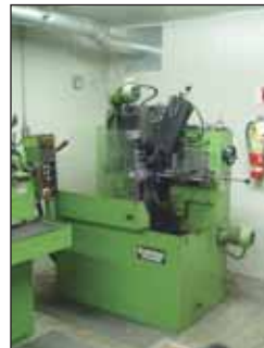
Vollmer Grinding Room Equipment