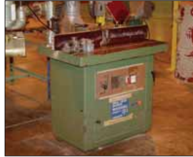
Wadkin BEL Shaper