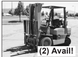
(2) Avail! Toyota & Komatsu Forklifts