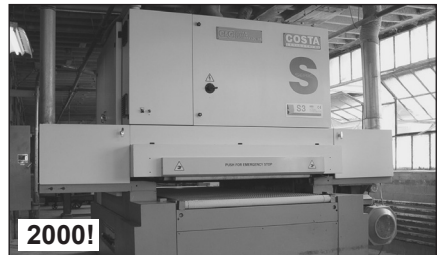
2000! Costa CNC (3) Head Wide Belt Sander w/ Crossbelt

Rough Mill Lines Planers Gang Rip Saws Hogs Straight Line Rips Return Conveyors Moulders Profile Grinders Dust Collection Chop Saws Tooling