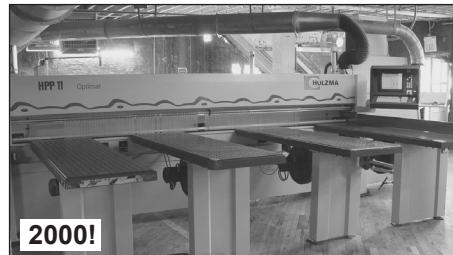
2000! Holzma OPT-HPP11/43 Front Loading Panel Saw