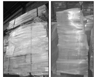
Kiln Dried Cherry, Red Oak, & Maple Blanks