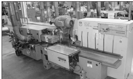
Weinig Unimat 22A/6Hd Hopper/feed thru moulder

Machining Centers Dbl. Surfacers Rough Mill Material Handling RF Gluers Moulders Profile Grinders Hauncher Planers Mortisers Straight Line Rip Saws Clamp Carriers