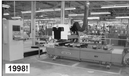
1998! Biesse Rover 321R CNC Machining Center