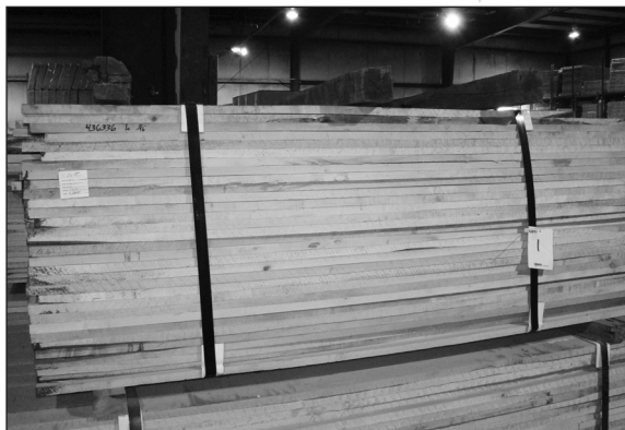
Huge Quantity Of Lumber