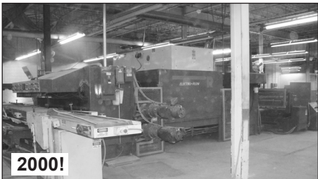
2000! Rosenquist Electro-Flow Model EF 100 feed thru RF Panel Gluer