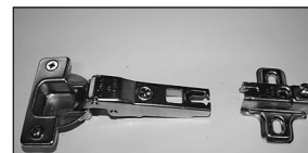
1000's Avail! Ferrari Door Hinges