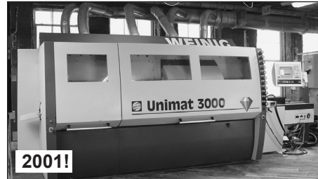
2001! Weinig U3000 (6) Head Hopper Feed Moulder