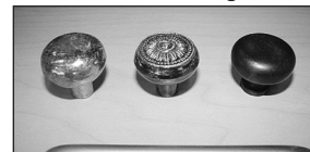
1000's Avail! Door & Drawer Pulls