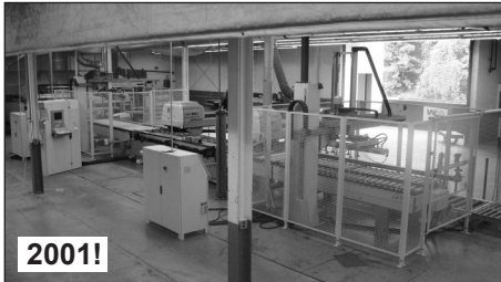
2001! Biesse Rover 336L Dbl. Head Feed Thru CNC Machining Center