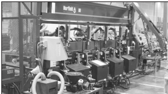
Norfield Eagle CNC Prehung Door System