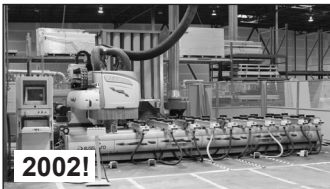
2002! Busellato Jet 5 CNC Machining Center

Copy Lathe Pallet Racking Profilers Table Saws Sliding Table Saws Dbl. End Tenoner pallet Jacks Shapers & Much More!