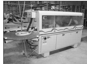
Brandt Optimat KDN340 Sgl. Sided Hot Melt Edgebander

CNC Routers Straight Line Rips Wide Belt Sanders Planers Horz. Borers CNC Dovetailers Edgebanders Forklift Cut Off Saws Packaging Equip. Dust Collection Routers