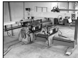
Biesse B5 32mm Borer (1996)