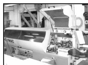
Polymac Edge Bander