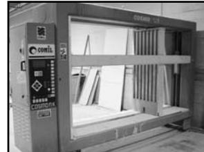
Comil NK-1 Case Clamp (1994)