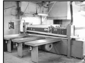
Homag Espana CH-10 - 32 - 32 Panel Saw