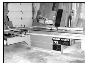
Altendorf F-45 Sliding Table Saw

CONNECTING BUYERS & SELLERS THROUGH TECHNOLOGY!