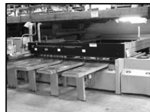
Selco WNT - 200 Rear Loading Panel Saw (1993)